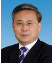
Guo Shuqing Governor, Shandong Province