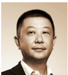
Zhang Yong Board Chairman, Sichuan Haidilao Catering Company Ltd