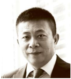
Charles Chao Chairman and CEO, SINA Corporation