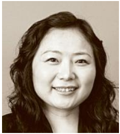
Wu Yajun Chairwoman, Longfor Group