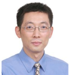
Dr. Shi Yigong Member, Chinese Academy of Sciences Dean, School of Life Sciences, Tsinghua University